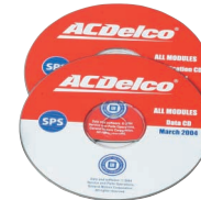
No. 3625-16 – GM ACDelco All Modules Reprogramming Starter Kit.

GM ACDelco All Modules Reprogramming Starter Kit – This software provides you with the ability to reprogram 1993 and newer GM powertrain, body, and chassis controllers. Kit includes a 12-month subscription to the authentic GM aftermarket Expertec Pro software on CD-ROM disks, which will keep you updated.*