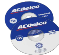
No. 3625-17 – GM ACDelco TIS Starter Kit.

GM ACDelco TIS Starter Kit – This kit provides you with the ability to reprogram 1993 and newer GM powertrain, body, and chassis controllers. In addition, this option contains software that allows you to use your PC to update the software on your Tech 2 Flash's PCMCIA card as the updates become available. The PC-based software also gives you the ability to play back and analyze snapshots taken with your Tech 2 Flash. Kit includes a 12-month subscription to the authentic GM aftermarket ACDelco TIS software on CD-ROM disks, which will keep you updated.*