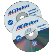
No. 3625-02 – GM ACDelco SPS Reprogramming Starter Kit.

GM ACDelco SPS Reprogramming Starter Kit – This option provides you with the ability to reprogram 1993 and newer GM powertrain controllers. Kit includes a 12-month subscription to the authentic GM aftermarket Expertec SPS software on CD-ROM disks, which will keep you updated.*