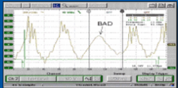
Bad injector on four cylinder Honda capture