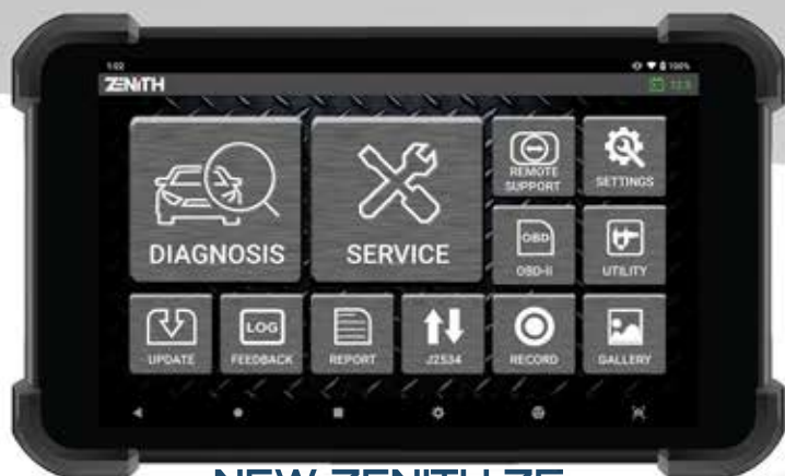
NEW ZENITH Z5