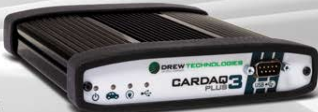
J2534 PASS THRU