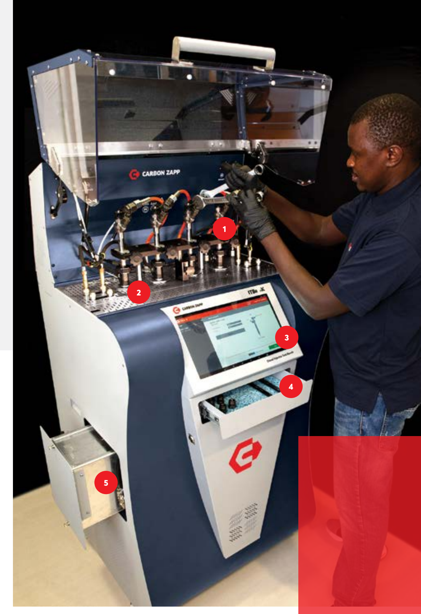
*New database and Coding is continiously being updated to new EU6 applications